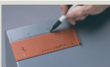
STEP 2 MARK THE CONDUIT COMBINATION